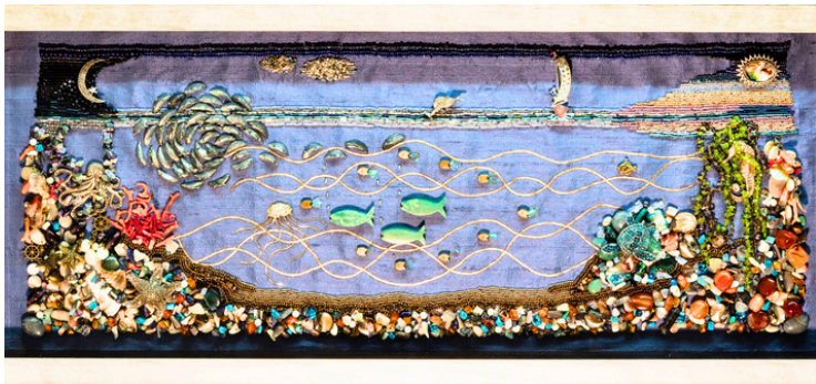
“Ocean: Shoal” features swirling shoals of fish, octopus, seahorses and shells are brought into relief using Abalone Shell, Agate, Coral, Marble, Moonstone, Pearls, Silver and multi-coloured Quartz and Glass. £995 (Sold)