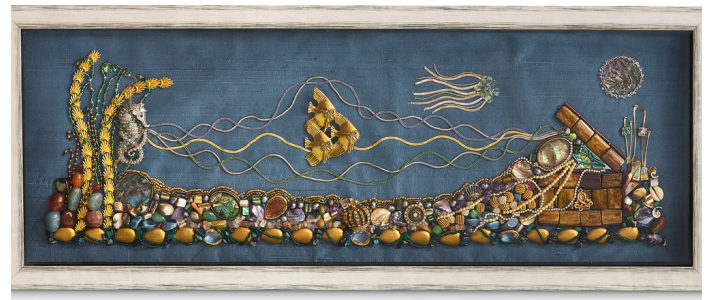
“Ocean: Treasure Chest”, on the bottom of the sea, using abalone Shell, Agate, Coral, Marble, Moonstone, Pearls, Silver, multi-coloured Quartz and featuring Seahorse, deco fish and Octopus. £995