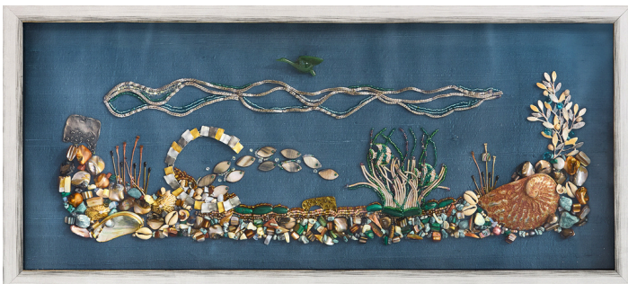
“Ocean: Tropical Water” features multiple elements, including Blue Quartz, Malachite, Clear Fluorite, Silver and Glass, alongside jewelled tropical fish. £995