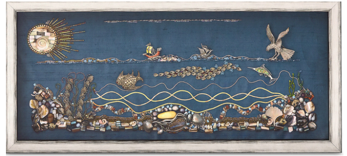
“Ocean: Sea Eagle” features the grandest of ocean birds of prey, fishing over a sea bed of pearls, polished shells and stones, jewelled sea creatures and gold thread. £995