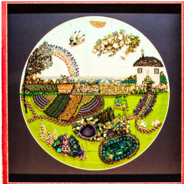
“Myth & Magic: Secret Cottage Garden” combines elements of Blue Quartz, Malachite, Clear Fluorite, Silver and Glass, alongside jewelled animals and garden creatures to create a scene from childhood memory. 43cm x 43cm £1,495

The art shown herein is a selection from a larger collection of works by Jenny Junior.