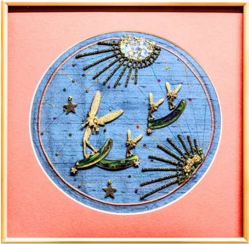
“Myth & Magic: Spirit of Beauty” is a mystical scene depicting Celtic “faeries” travelling across rays of emanating magic, made in Abalone Shell, Silver, Sequins, Rhinestones and Glass. 30cm x 30cm £300 (Sold)