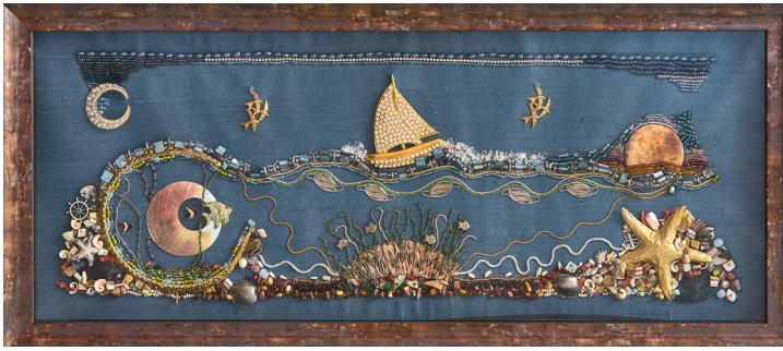
“Ocean: Sailing at Sunset” is a voyage between the setting sun and a rising jewel moon, using polished shells, coral, gold jewel starfish and sea creatures to depict the undersea world. £995